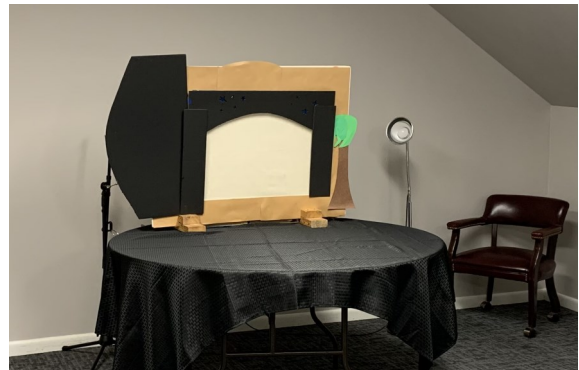
Studio and stage for children’s Christmas pageant