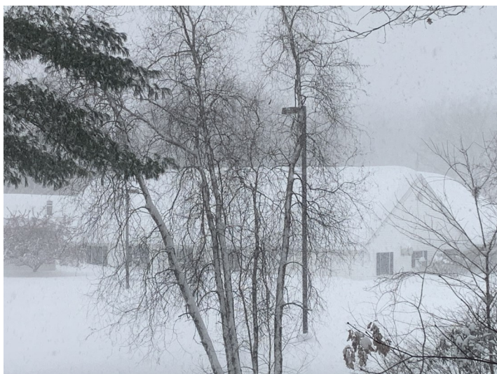
View from the rectory