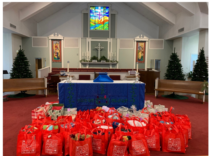
Holiday gift bags ready for HAWS