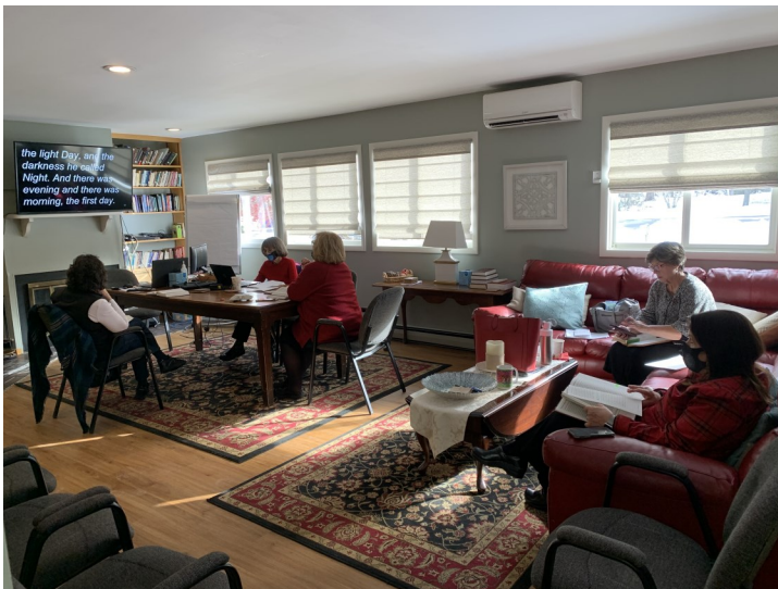
Volunteers working on power point slides for our services