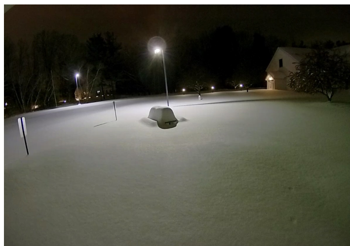
View from St. George's at end of the pre-Christmas storm