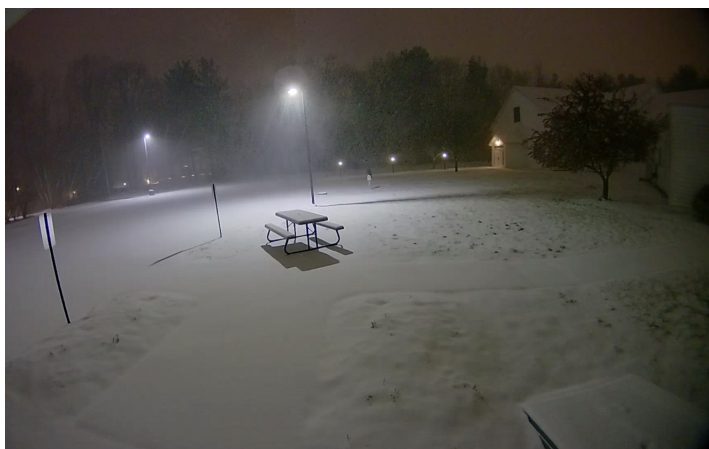
View from St. George's at beginning of the pre-Christmas storm