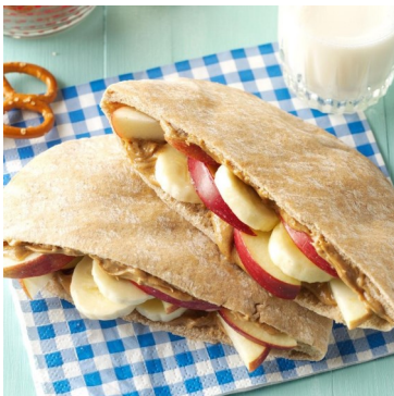
Peanut Butter Pit