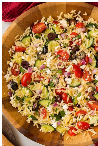
Greek Orzo Salad