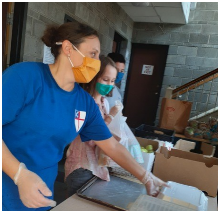
Serving at Loaves and Fishes

You can connect with The Way of the Cross prayers and meditations even if you do not want to gather inside or leave the vicinity of home. Practice with speaking about heavy topics like death and sorrow with children may be more important this year.