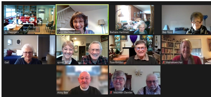
From Sunday Morning Prayer online