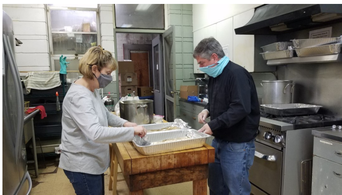
Preparing the lunch to go at Loaves and Fishes feeding ministry