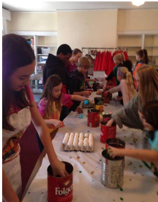
Coloring Easter Eggs - March 20th

Join the Christ the King Youth Ministry team for a night of awesome games, activities, snacks, worship, prayer, and teaching but mostly epic games, and no sleep! The annual Cathedral Lock-In is happening Friday April 1st at 6:00 p.m. - Saturday April 2nd at 9:00 a.m. at The Cathedral of All Saints, 62 South Swan St., Albany, NY 12210. All kids in 7th-12th grade should come out for this fantastic night of fun and games with a Clue theme at the Cathedral. This is a great retreat to bring a friend. Cost is $25 per person. More Info at: http://www.beavercrossministries.org .