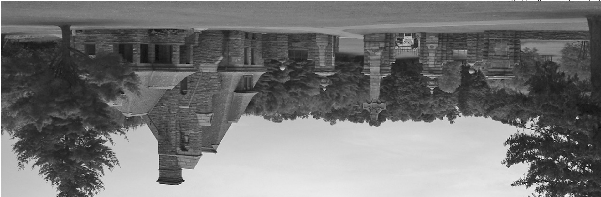
Lodge and entry to Bayside Cemetery

From Burial Ground to Rural Cemetery Bayside was established in 1865 under the direction of the Clarkson family and other influential members of Trinity Episcopal Church. It superseded earlier, simpler cemeteries in the Village of Potsdam, which were closed and their remains moved to Bayside. Bayside is a rural cemetery, meaning that it is outside of town, in a landscaped, park-like setting. It was modeled on Boston's Mount Auburn Cemetery, the first and most famous rural or garden cemetery, and designed by a Boston landscape architect, L. R. Briggs.