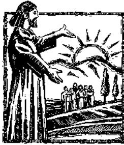
“HE IS LORD OF ALL.”