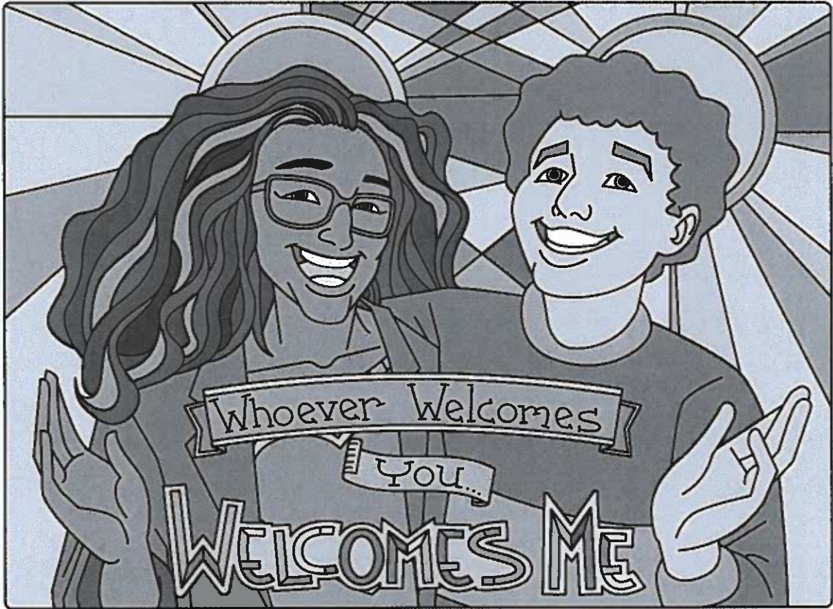
Matthew 10:40-42 · illustratedministry.com