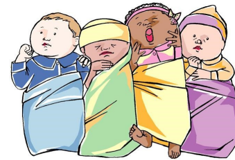
Baby A Baby B