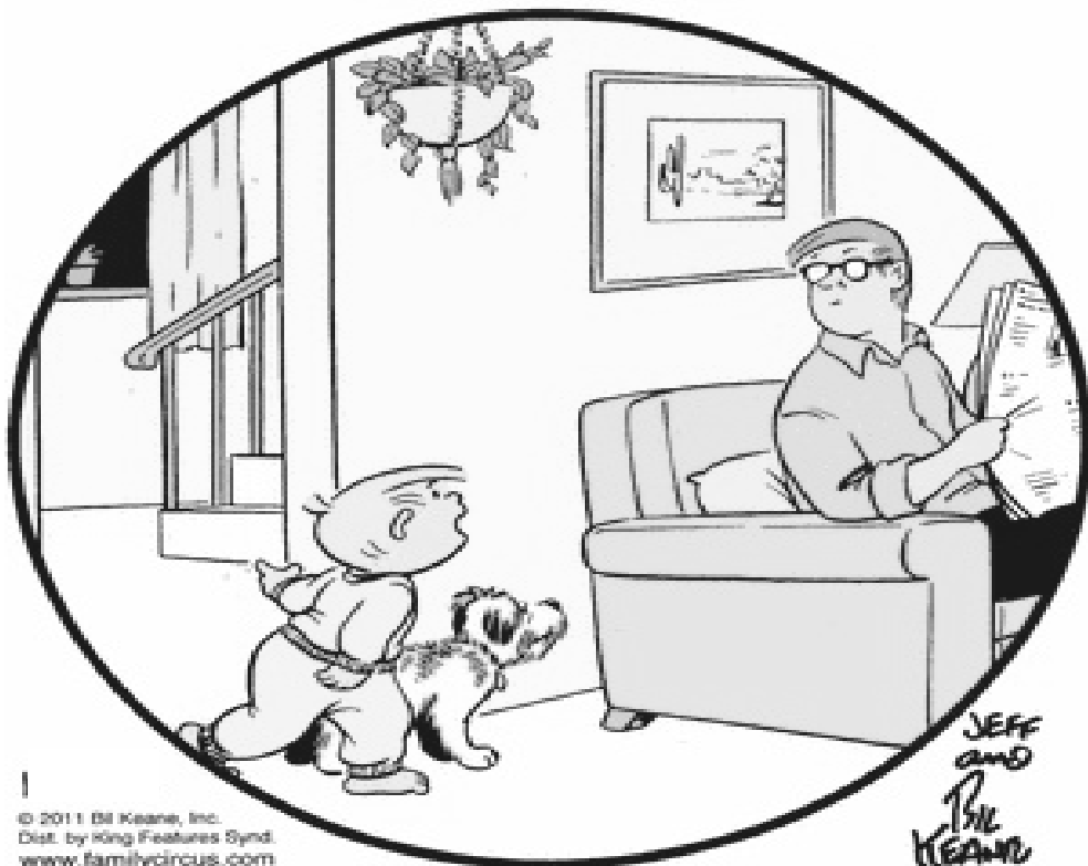
"I'm gonna say my prayers, Daddy. Do you have any requests?"