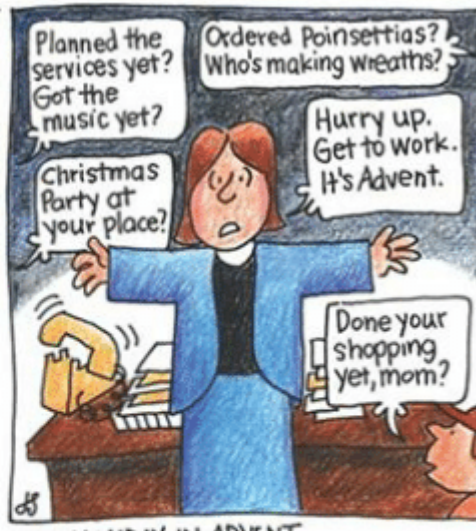
ONE MONDAY IN ADVENT