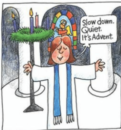
ONE SUNDAY IN ADVENT

Christmas Day Tuesday, December 25 11:00AM Holy Eucharist