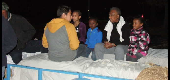
Harvest Fest Hay Ride Rotation