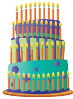
Young at Heart