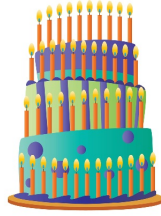
Young at Heart