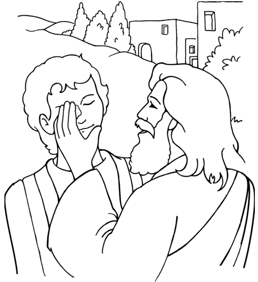
Jesus heals a blind man. John 9