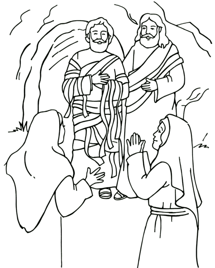
Jesus Raises Lazarus