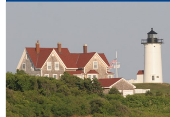
Lighthouse overlooking Vineyard Sound