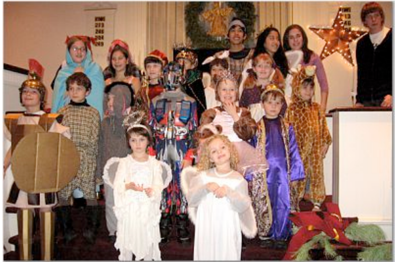
This year's Christmas Pageant, "The Best Present Ever," went off without a hitch. Performers ranged in age from four to 14.

Sponsored by the Christian humanitarian organization World Vision, the 30-Hour Famine is an international movement to fight hunger worldwide. Every year, more than 500,000 students get involved. MYFers are seeking sponsors to make hourly pledges (i.e., $1 per hour) for the youth to fast for 30 hours. The fasters and their chaperones will stay overnight at the church, taking part in a variety of group activities designed to raise awareness of world hunger.