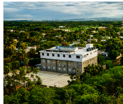
Seminary, Mercy Center, Concordia Lutheran Church, Concordia Lutheran School, and new basketball court and playing area in Palmar Arriba, a rural area outside of Santiago.

Our itinerary will include a presentation at MISSION CENTRAL on Saturday July 23. Please contact us if you are interested in a presentation at your congregation, ladies' group, mission festival, or other activity!