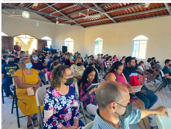
Interior of the new church during its dedication in La Paz.