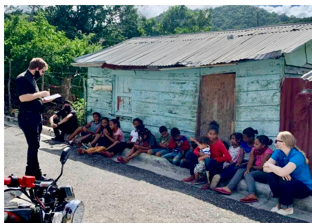
Curb-side Sunday School in Ocoa led by seminary field workers & deaconess interns. As mission expansion opportunities arise we pray for more workers to preach the Gospel and plant Lutheran churches.