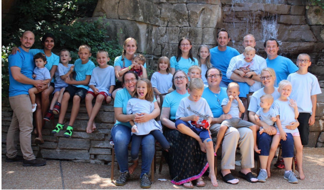
Time with children and grandchildren at the St. Louis Zoo.