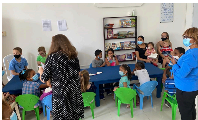
Above: Sunday School at Pueblo Nuevo. Below: a few girls sitting in front of Concordia Lutheran School in Palmar Arriba.