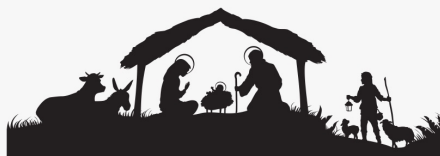
PHOTO GALLERY... Since Christmas is a time when we think of celebrating the birth of our Savior with family members, we want to share photos of our 6 children, spouses and 19 grandchildren: