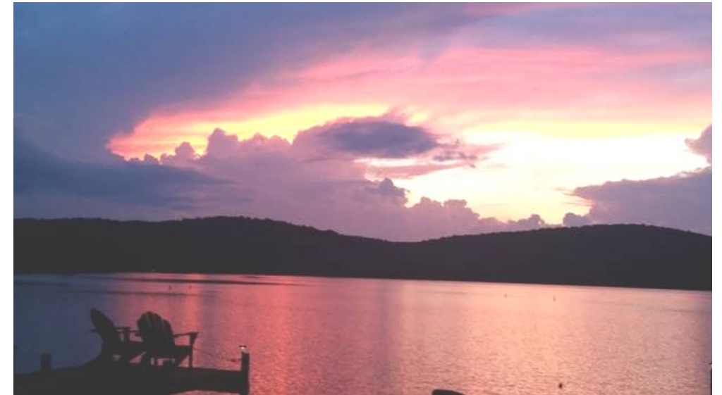
Sunset at Caroga Lake