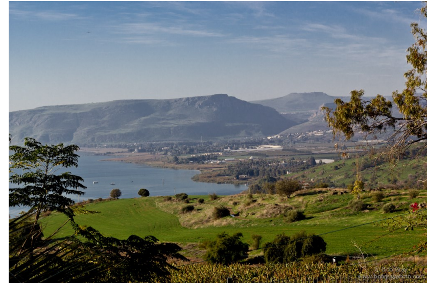
The place where Jesus gave the Sermon on the Mount in Israel