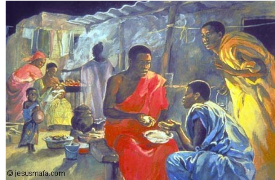
The Meal at Emmaus with Jesus