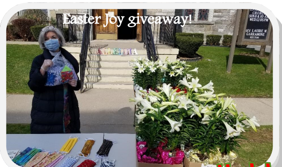
Easter Joy giveaway!