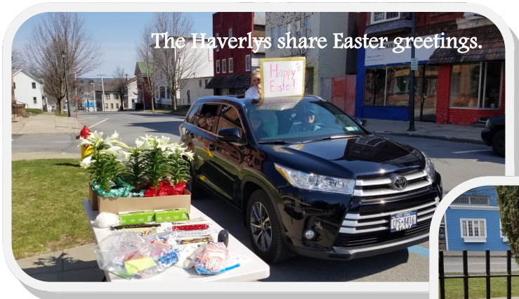
The Haverlys share Easter greetings.