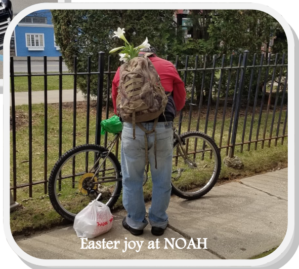
Easter joy at NOAH