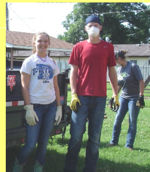
Helping, youthful hands from FBC, Depew, Oklahoma