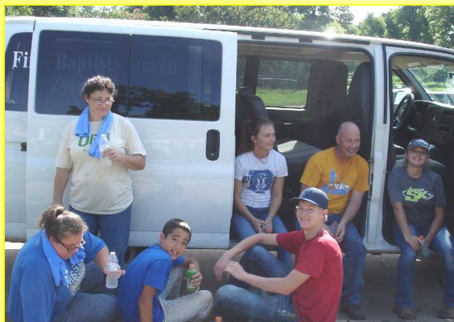
Seven FBC, Depew volunteers take a well-earned water break