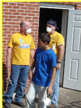
Depew FBC Pastor and a KY DR team member practice safe breathing in a moldy basement