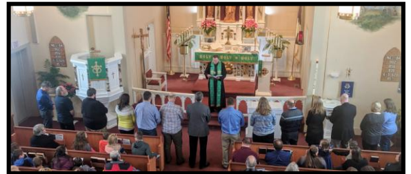
Installation of Officers

DVD's are available of the church service. Call the church office at 920-845-2095 and one of our volunteers will deliver it to you.