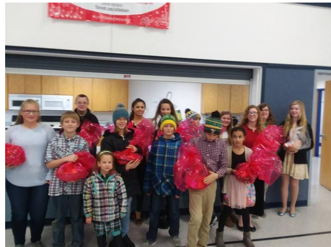
Youth Group Fruit Basket Delivery