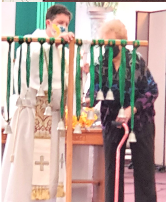
A bell was hung in memory of Lester Alcorn who passed away on March 9, 2020