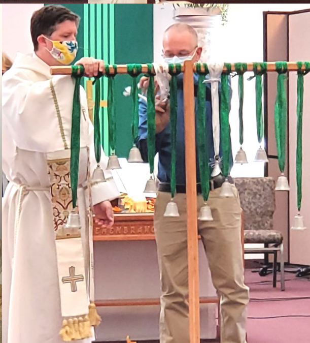
A bell was hung in memory of Lee Clark who passed away on September 8, 2020