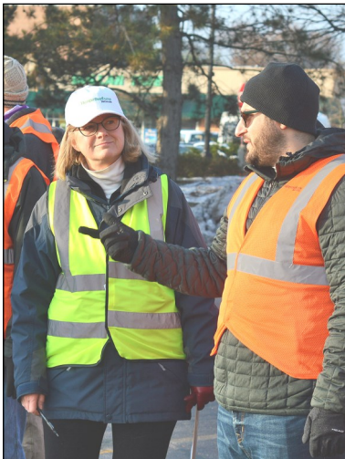
Hunger Resource Outreach Day