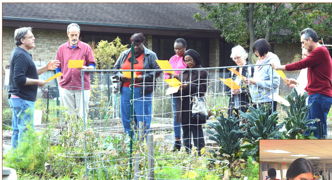
Photos from the Harvest Festival