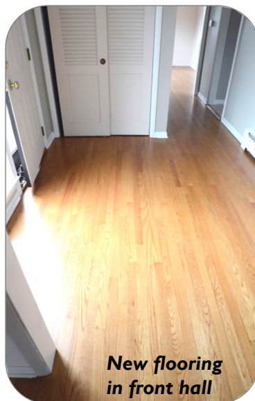
New flooring in front hall