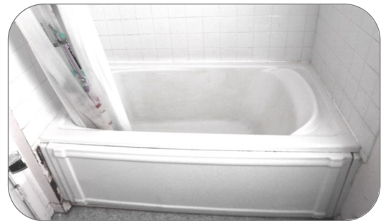
Tub in master bath, before and after