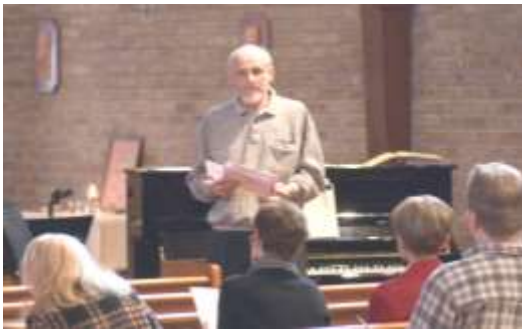
Jazz Sunday February 9, 2014