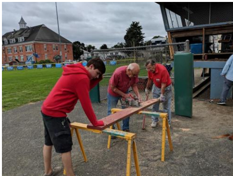
Left: Windsor Locks Lions prepare to replace wood trim at the town's Pesci Park Little League facility.

The painting and repair work to the facilities received coverage from a reporter from the Hartford Courant.