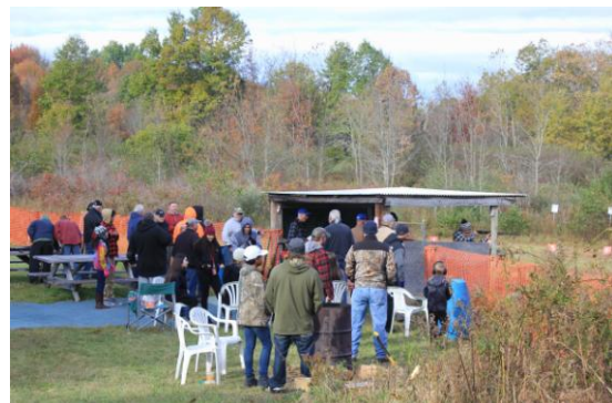
The East Windsor Lions Club 47th Turkey Shoot brought out quite a number of "hunters".

The East Windsor Lions Club Turkey Shoot has provided SAFE fun for the entire family for the past 46 years of this event, which supports the sight-saving and other charitable activities of the club and is its largest fundraising event each year.