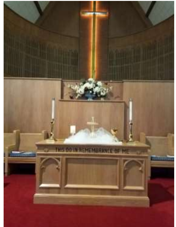
Transfiguration of the Lord

Month Plate & Pledge Expenses January $13,058.00 $12,346.79 Received Year to Date $13,058.00 Over ( Under ) $808.00