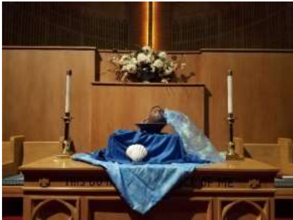
Baptism of the Lord