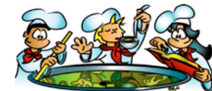
The Youth Group worked the Soup Kitchen on Saturday, February 18th.