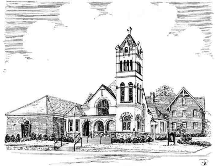
Central United Methodist Church