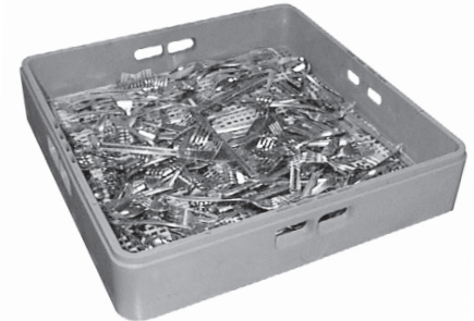
KNIVES, FORKS & SPOONS