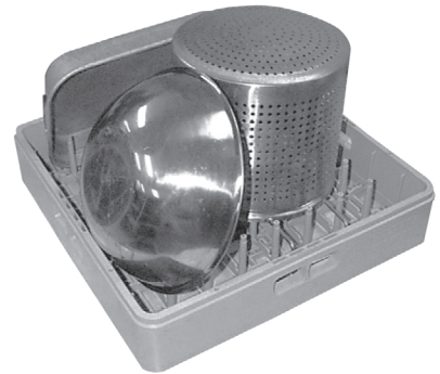
ASSORTED PANS & BOWLS