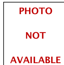
DONALD KNIGHT August 30