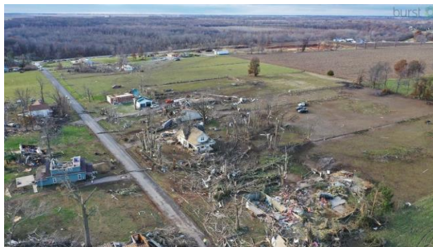
A section of Taylorville after the Dec. 1 tornados.

Alternatively, you can go online to the Missions for Taylorville Facebook page and donate electronically through the blue Donate Button on that page.