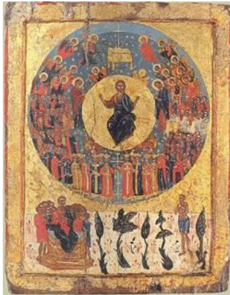
Greek icon of saints and angels around Christ's throne (c. 1700)

In early Christian tradition, saints' days began as a way to mark the anniversary of a martyr's death — his or her "birthday" as a saint. By the middle of the church's first millennium, there were so many martyrs (particularly due to the persecution of Diocletian) that it was hard to give them all their due. All Saints' Day was established as an opportunity to honor all the saints, known and unknown.