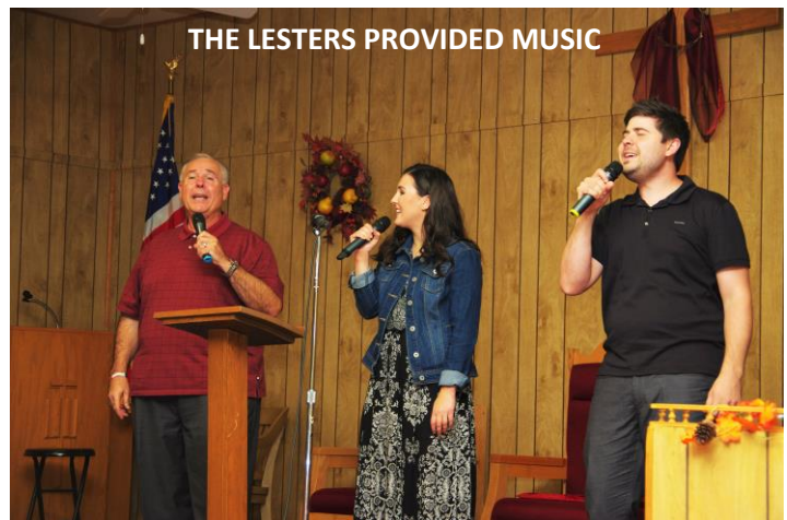
THE LESTERS PROVIDED MUSIC

2016 MCBA ANNUAL MEETING SEPTEMBER 10 MT. HERMAN BAPTIST CHURCH