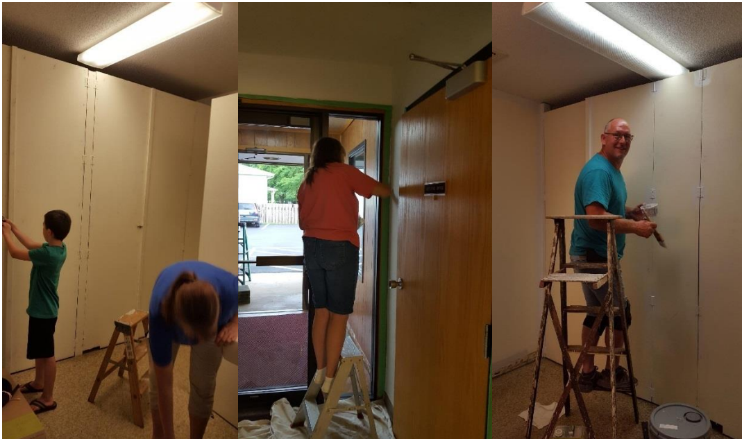
The work crew doing maintenance at the Minnesota/Wisconsin Baptist State Convention Office.