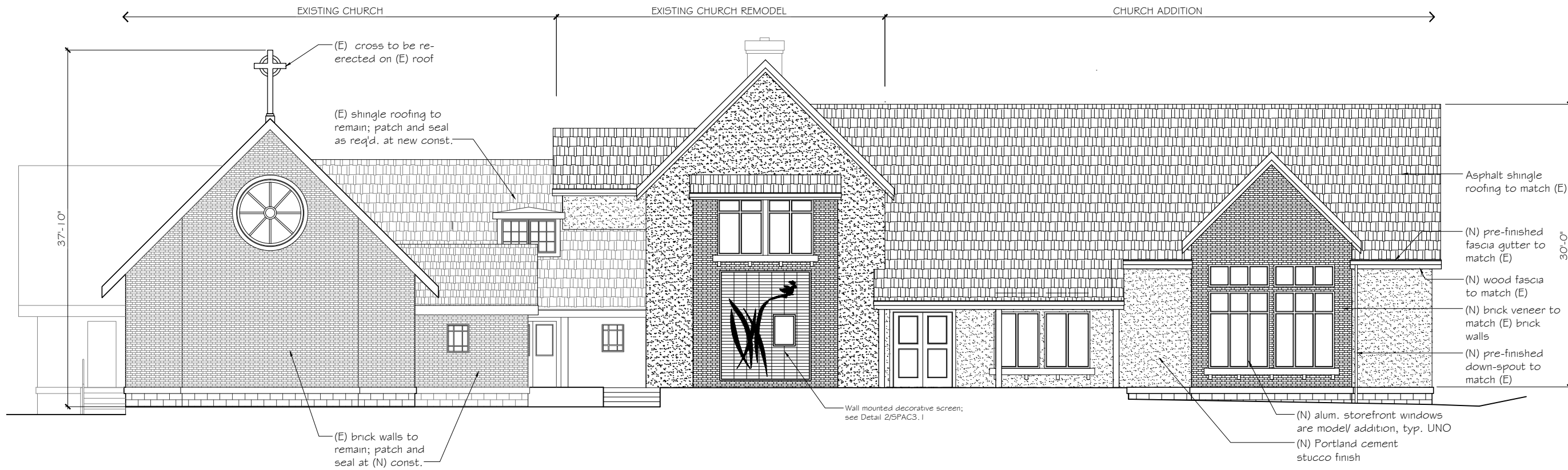
1 PROPOSED WEST ELEVATION SCALE: 3/16"=1'-0"