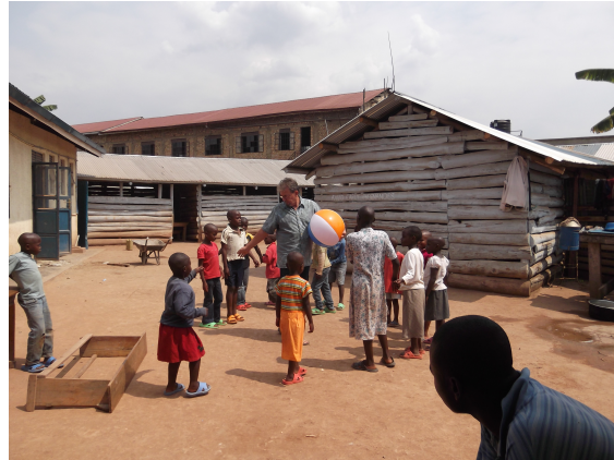
Our current temporary classrooms have cement floors and metal roofing, but the walls are split logs. (The taller, two-story building in the background is Trinity College next door)

With a good, permanent structure and dorm for the boarding students, the school could become the major source of income for the orphanage. Our ultimate goal is for the orphanage to be entirely self-supporting.