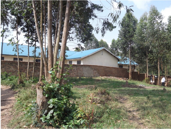
Twinomujuni Children's Home/ Roseville Preparatory School Kabale, Uganda

Shepherd's Love 6249 Westbrook Drive Citrus Heights, CA 95621