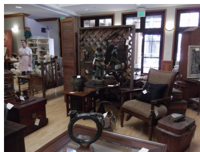
The Estate Sale Side

Last year some of the proceeds purchased a water collection tank and finished tiling the floors in Twinomujuni Children's Home, this year's contribution paid to buy the additional land we needed to build the permanent school building. Thank you, Grace Episcopal Church, St. Helena!