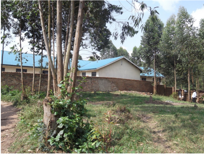
Twinomujuni Children's Home/ Roseville Preparatory School Kabale, Uganda

Shepherd's Love 6249 Westbrook Drive Citrus Heights, CA 95621