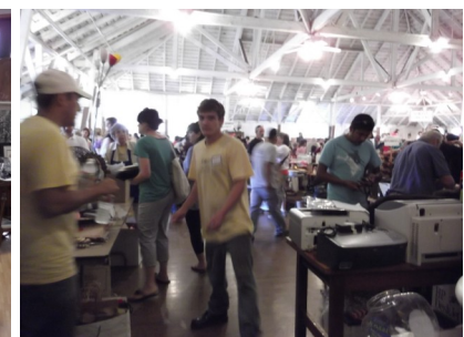
The "Garage Sale" Side