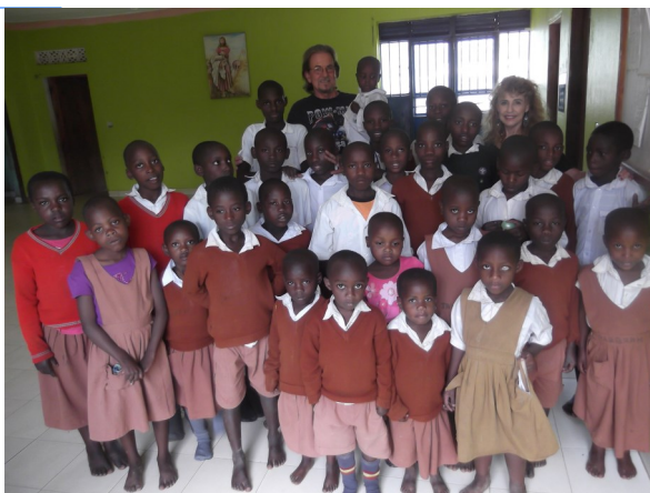
October 2013—Surrounded by Love!!!