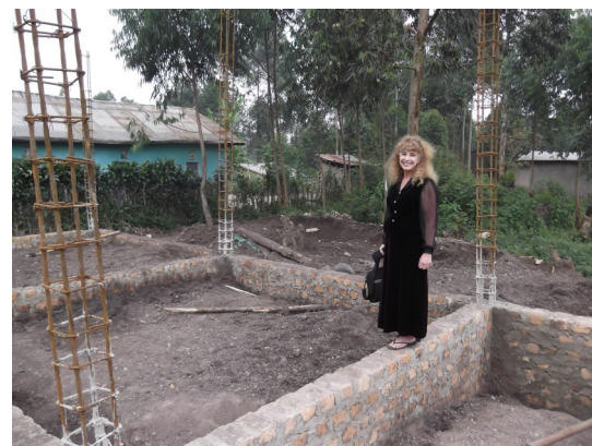
To this (January 2013)