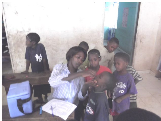
Visiting nurse gives polio vaccine