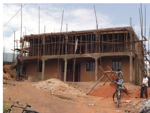
To this— October 2013—and all done by hand!