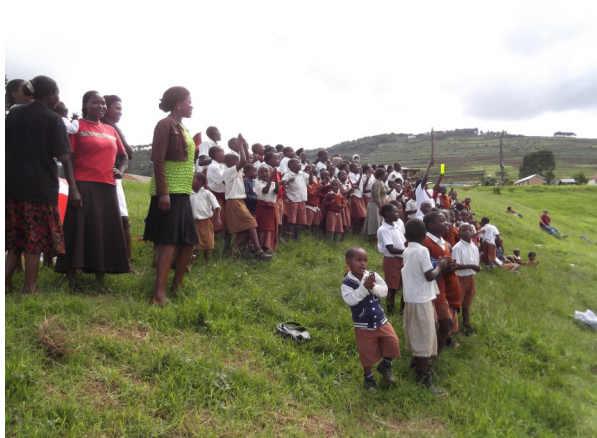
Cheering for Roseville Preparatory School in a soccer match. We won 3-1