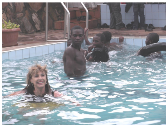
We take the kids swimming