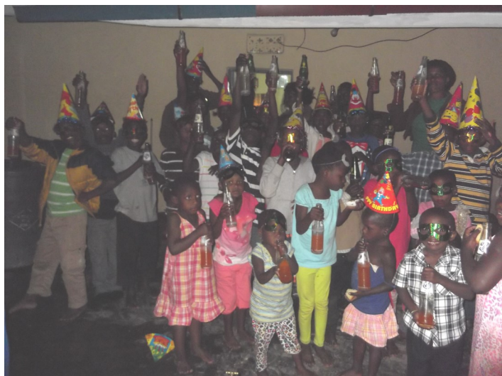
Birthday Party for all the kids. We don't know many of their birthdays so just one big party a couple times a year!