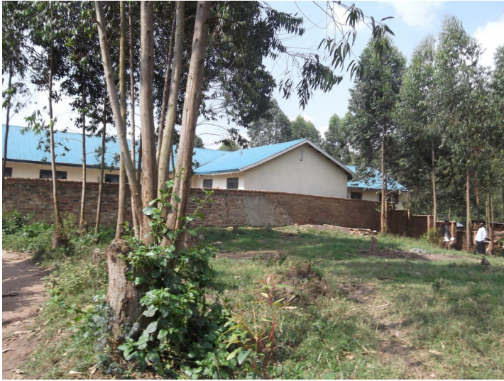
Twinomujuni Children's Home/ Roseville Preparatory School Kabale, Uganda

Shepherd's Love 6249 Westbrook Drive Citrus Heights, CA 95621