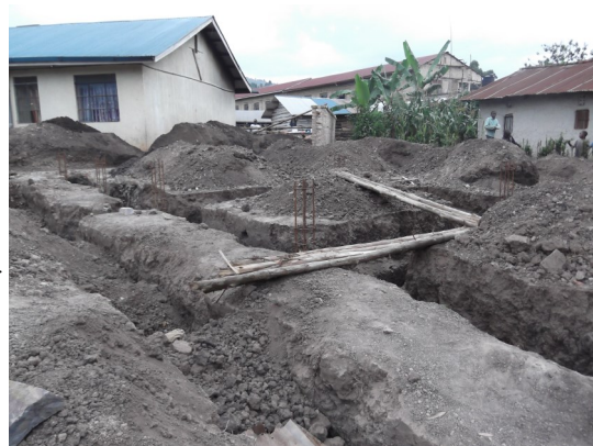
The building of the new dormitory—from this November 2012

The building of the new dormitory is almost complete. The first floor is complete and the school boys who board during the school months are moved in. As soon as the second story is completed—a matter of a few more weeks, the school girl boarders will be moved in and our kids will have their home back to themselves for the first time in five years! It will be freshly painted and they will be able to keep it clean, have pictures on the wall that will stay, and be a family unto themselves. We have waited a long time for this and give a big “thank you!” to Grace Episcopal Church in St. Helena and to the Resurrection Run in Sacramento who were the major contributors to this project.