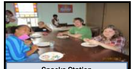
Snacks Station Summer Program 2013

Pantry, Clothing Closet, Bilingual Bible Study, English Bible Study, summer program and soon we will start a Young Parents Conversation Group. Our mission statement is: “To develop a community of persons who, through partnerships based on faith, take responsibility for the neighborhood, leading to positive and sustainable change.” As a Church and Community Worker we work to bring the community to the church and the church to the community. We offer our participants a safe space where they can come and see the grace and love of God. Our program is growing. We have new participants in the Tutoring program and new tutors, but we still need more tutors. We have new participants in the Adults and Youth Life Skills class. With the support of volunteers from different UM Churches and people from the community, this year we served 52 kids in our summer program and we sent 30 kids to camp.